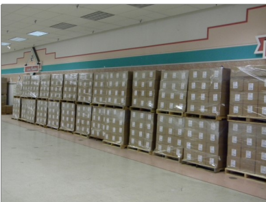
Pallets read to go out.