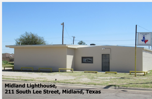
Midland Lighthouse, 211 South Lee Street, Midland, Texas

renovations are now complete. We currently have 10 blind and visually impaired employees and a supervisor.