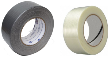
Clear Packaging tape, duct tape and filament tape