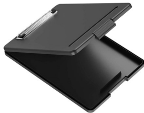
File Box Clipboard