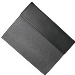
Tri-fold Padfolio with Magnetic Closure