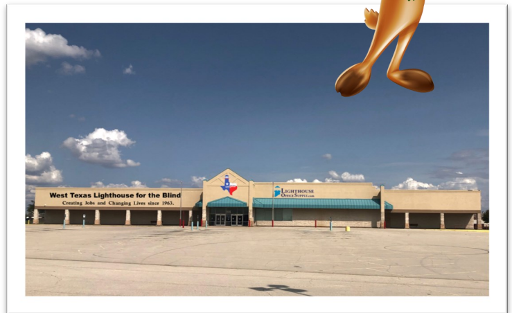
New Location: 555 East 6th Street