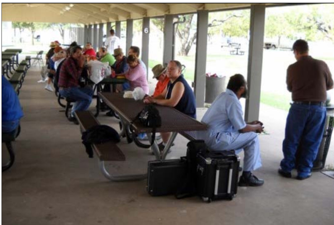
The Lighthouse gang is ready to have some fun