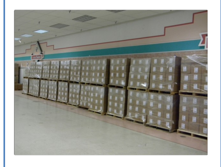
Pallets read to go out.